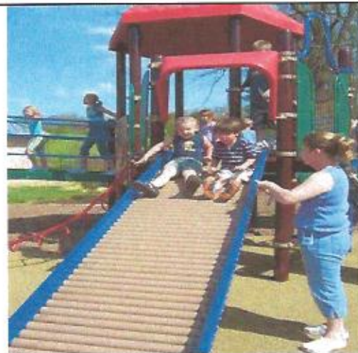
Two children race down the roller slide.