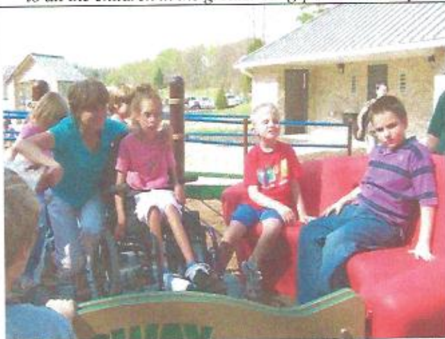
Children confined to a wheel chair such as the young girl above can participate on the sway swing.