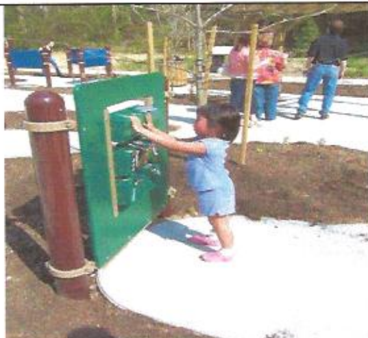
A four year old tries to line up the butterfly in one of the interpretive elements.